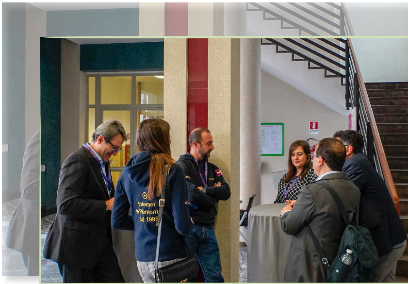
(INFORMAL DISCUSSION ON BIG DATA GOVERNANCE IN THE HALL)

The new ethical challenges require a better awareness, knowledge and evolution of evaluation criteria for users, ICT professionals and policy makers involved in data management. It was also emphasized the impulse that open data applications can have in the economic context [19].