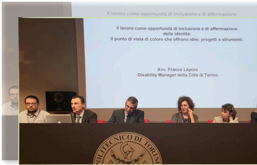
(SESSION 13 - WORK AS AN INCLUSION OPPORTUNITY AND AN AFFIRMATION OF IDENTITY)

The concept of digital citizenship as extension of citizenship and ability to participate in digital society has been widely discussed.