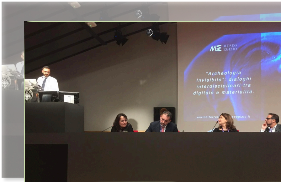
(SESSION 7 - DIGITAL AND CULTURAL INNOVATION IN TURIN)

The importance of AI tools to improve accessibility and social inclusion of disabled people was also highlighted [30].