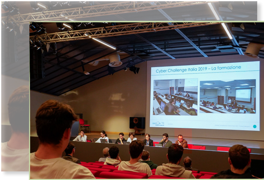
(SESSION 15- CYBERCHALLENGE.IT INITIATIVE)

The legal perspective and the hard implementation of regulatory models in the digital sphere has been explored. It was underlined that regulation by private companies seems to have a greater impact compared to public norms and regulation.