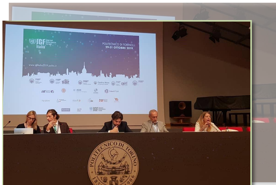
(SESSION 2 - CONTRACT FOR THE WEB / INTERNET BILL OF RIGHTS)

It was highlighted how these initiatives are undoubtedly seminal and still of relevance to the community. Nevertheless it outlined the need to consolidate existing documents and activate a new and broader project (manifesto) that takes into account how technologies, services and society have changed in the last decade since the publication of the Internet Bill of Rights. The importance of adopting a global framework, a set of ethical principles to safeguard human rights in the Internet was pointed. It was also underlined the importance to avoid Internet fragmentation [2].